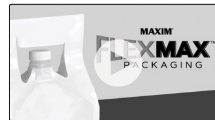
Learn more at MidlabFlexMax.com

Replace those bulky buckets. FlexMax packaged products empty completely and collapse to nothing for a more flexible, efficient way to clean. No more wasted product or storage space. No more difficulty carrying or transporting product. With the innovative FlexMax Packaging, Maxim has the answer in the bag.