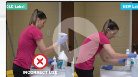
Learn more at PlusLabelSystem.com