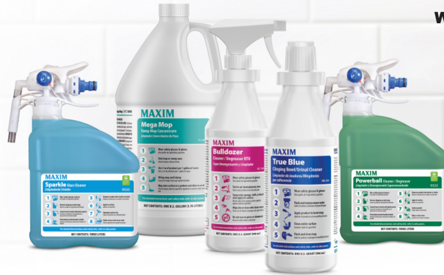
© 2018 Midlab, Inc. All Rights Reserved. PLUS Label System is a trademark of Midlab, Inc. Patent Pending.