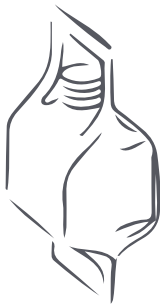
Easy to transport with handle