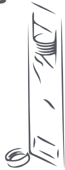
Collapses flat for disposal

Products in FlexMax packaging are easy to use, convenient to store, and cost efficient to ship. They're durable, lightweight, and... just like this flyer... collapse down flat.